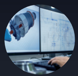
FEASIBILITY ANALYSIS OF REQUESTS